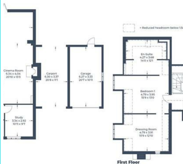
Illustration for identification purposes only, measurements are approximate, not to scale.

Approximate Gross Internal Area Ground Floor = 176 sq m / 1,894 sq ft First Floor = 141 sq m / 1,517 sq ft Total = 317 sq m / 3,411 sq ft